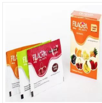
Filagra Oral Jelly 100 mg