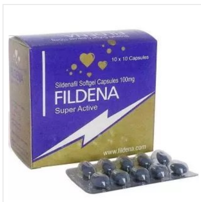
Fildena Super Active 100mg