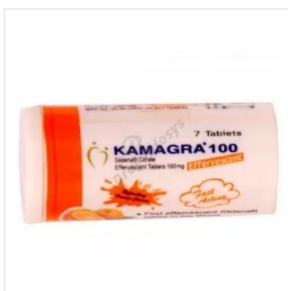
Kamagra Effervescent 100 mg