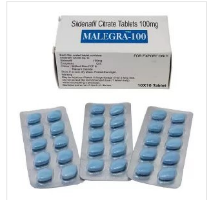
Malegra 100 mg $28.00