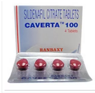
Caverta 100 mg