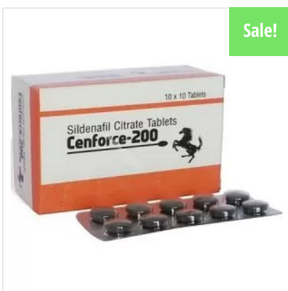
Cenforce 200 mg