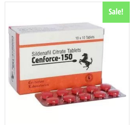
Cenforce 150 mg