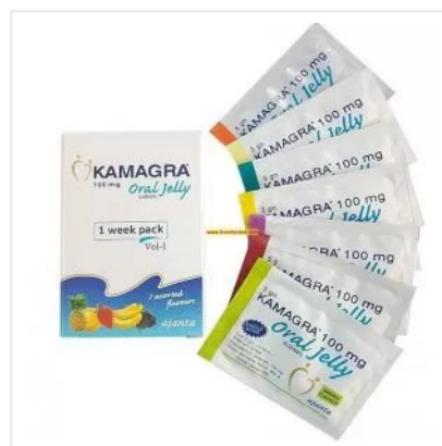
Kamagra Oral Jelly 100mg