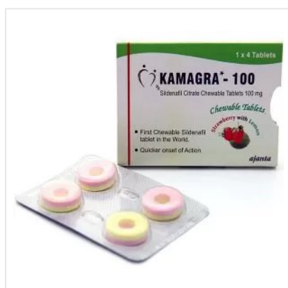
Kamagra Chewable Tablets 100