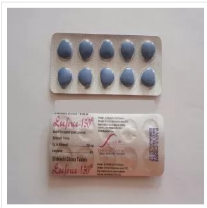
Leeforce 150 mg $17.00