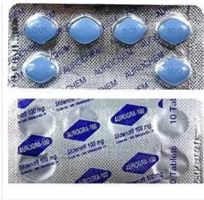
Aurogra 100 mg