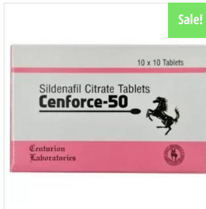
Cenforce 50 mg