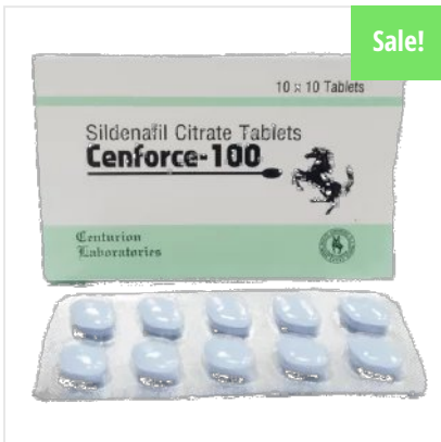
Cenforce 100 mg