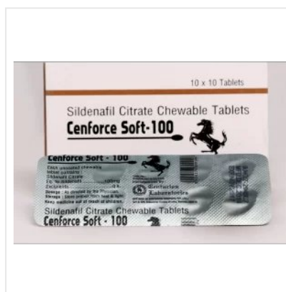
Cenforce Soft 100 mg