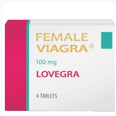
Lovegra 100 mg $25.00