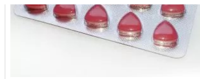
Fildena Extra Power 150 mg