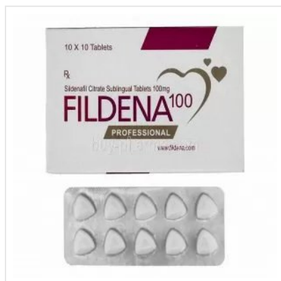
Fildena Professional 100 mg