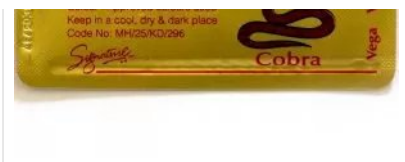
Cobra 120 mg