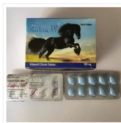
Leeforce 100 mg